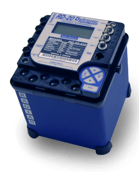
Typical Accuracy = +/- 0.01% Worst Case = +/- 0.04%